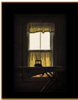
Ken Moran "Last Chore of The Day"